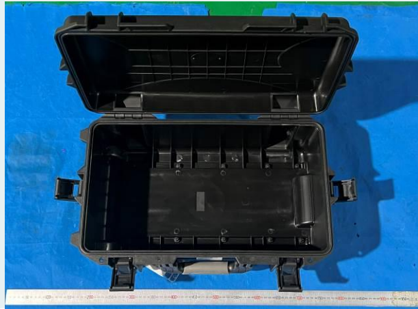
Fig.1-3 Sample appearance inspection before test