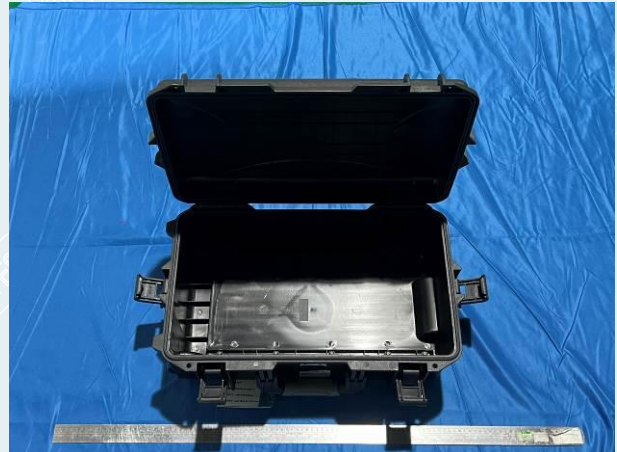
Fig.1-4 Sample unpacking inspection after test