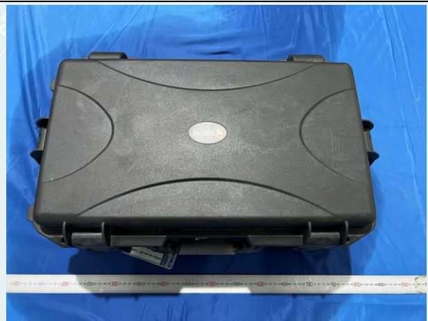
Fig.2-2 Sample appearance inspection after test