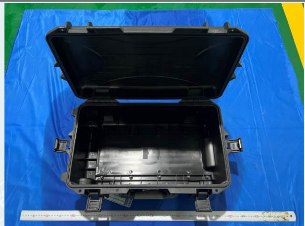
Fig.2-4 Sample unpacking inspection after test