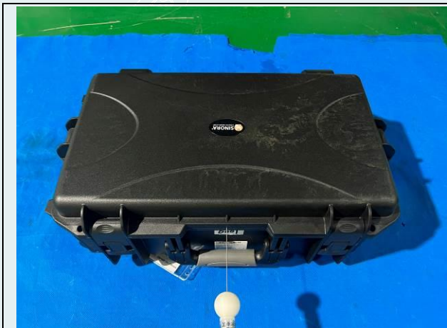
Fig.1-5 Metal probe inspection before test