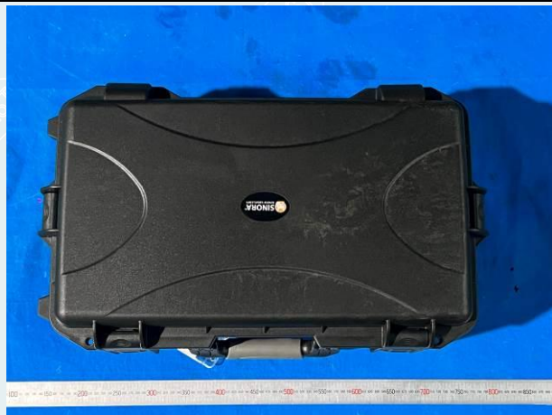
Fig.1-1 Sample appearance inspection before test