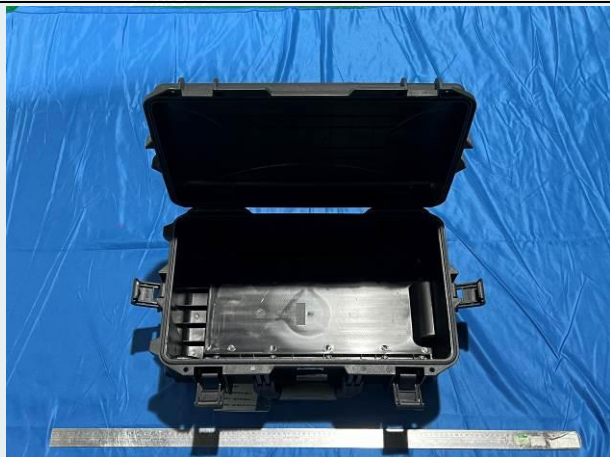
Fig.2-3 Sample unpacking inspection before test