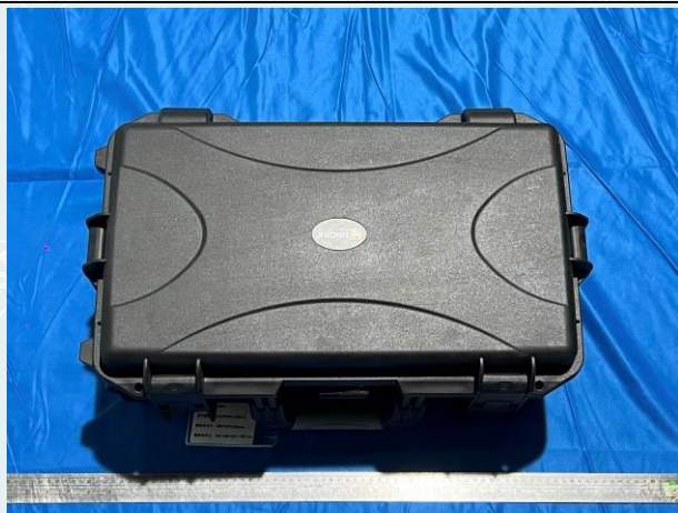
Fig.2-1 Sample appearance inspection before test