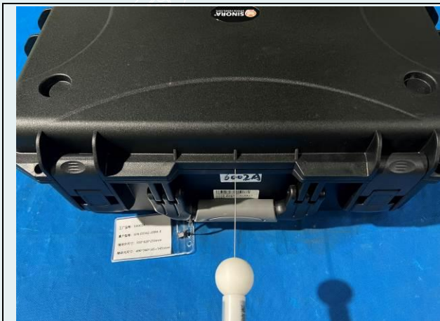
Fig.1-5 Metal probe inspection before test