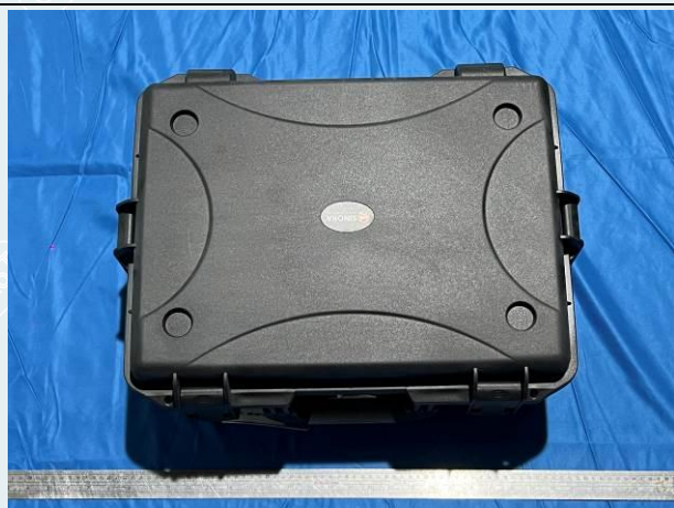
Fig.2-1 Sample appearance inspection before test