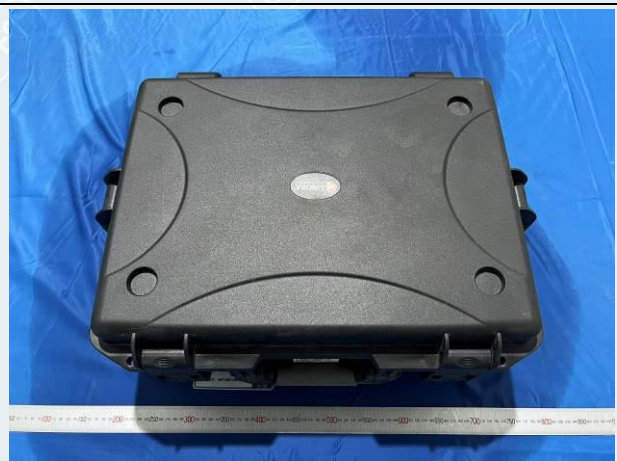
Fig.2-2 Sample appearance inspection after test