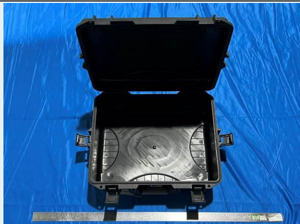
Fig.2-3 Sample unpacking inspection before test