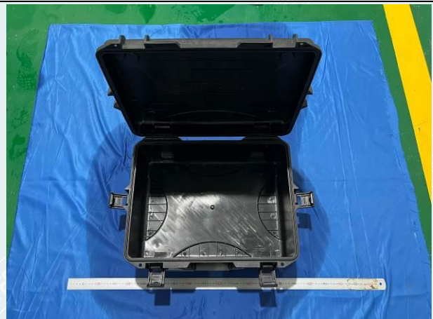
Fig.2-4 Sample unpacking inspection after test